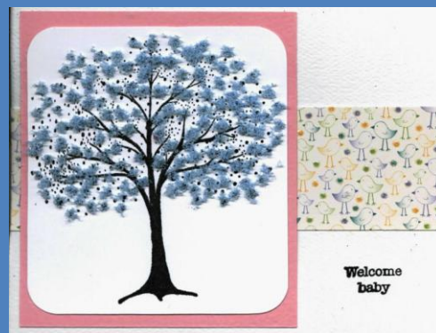
Artist: Julie Gerbitz 2 of 3 Make 'N Take Project

jazzy@stampingjazzystyle.com www.stampingjazzystyle.com